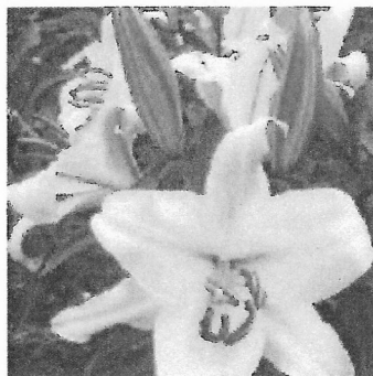
Pink Snowflake 8 (OT) white with pink buds and petal reverse, fragrant. 3-4', July/Aug