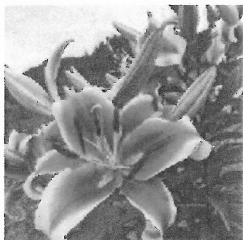
Flashpoint 8 (OT) red and cream, fragrant, outfacing. 5', July