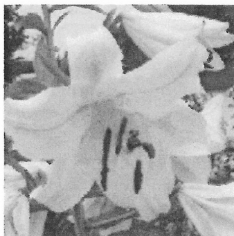
Conca d' Or 8 (OT) lemon, fragr., up/outfacing. 4-5', Jul/August