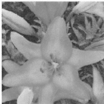
Royal Sunset 8 Pink with melon centers. 4', June