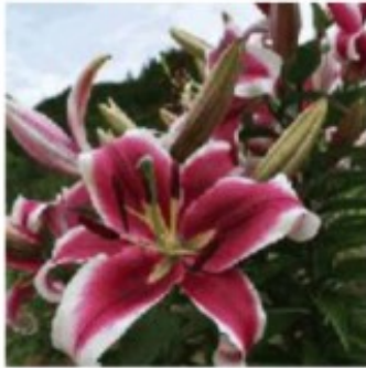
Flashpoint 8 (OT) red and cream, fragrant, outfacing. 5', July