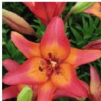
Royal Sunset 8 Pink with melon centers. 4', June