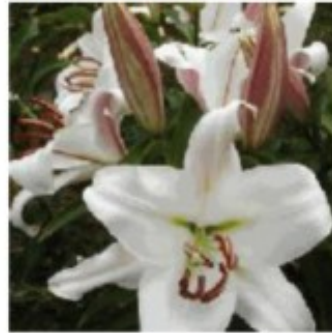
Pink Snowflake 8 (OT) white with pink buds and petal reverse, fragrant. 3-4', July/Aug