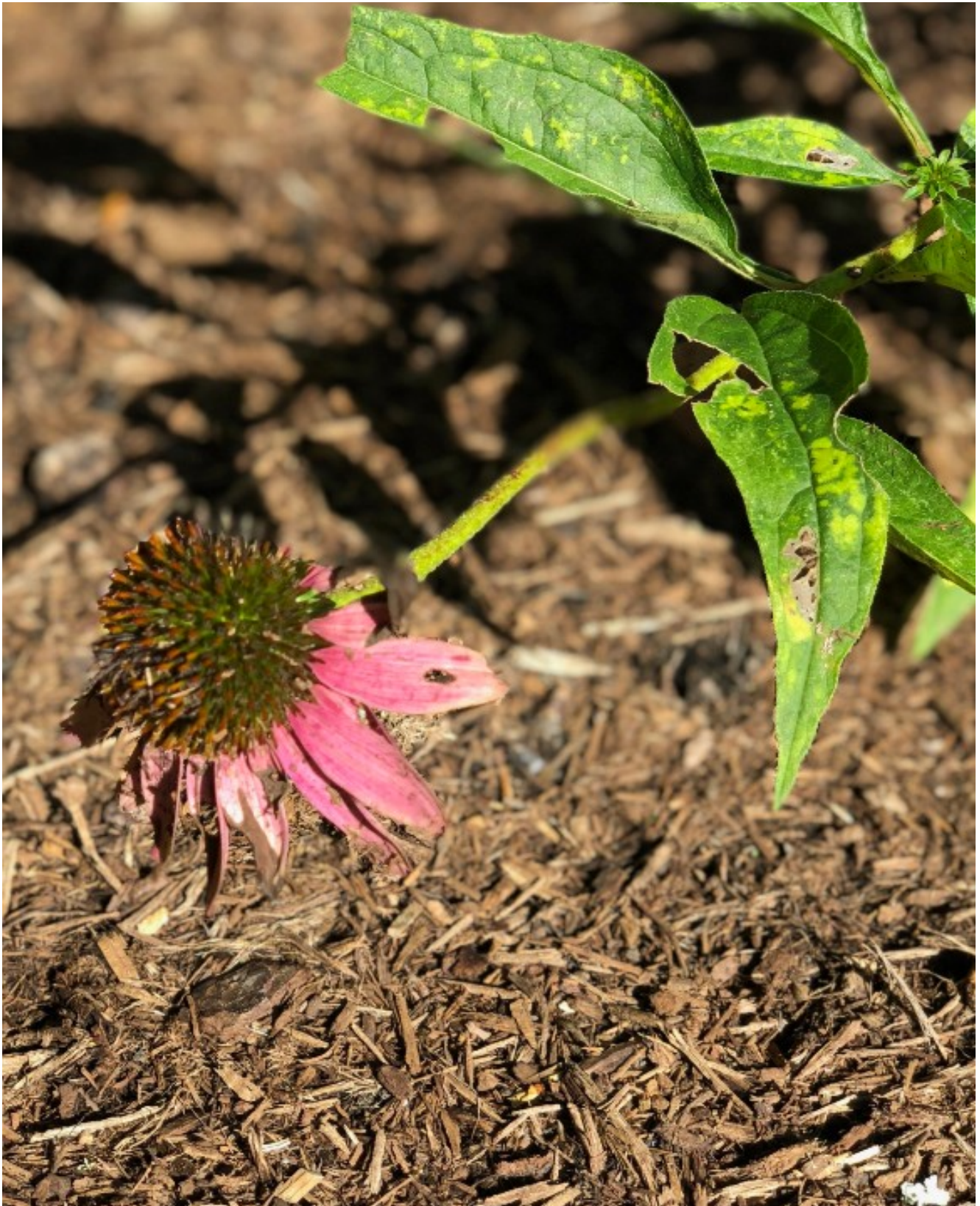
An echinacea purpurea bloom, going to seed.