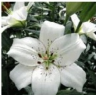
Eyeliner 8 (LA) White with petals edged in purple-black. 3-4', June